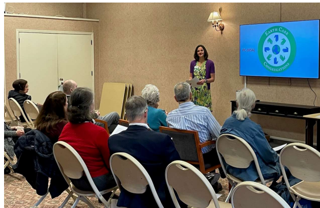
Top: Enjoying the eclipse